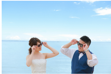
Magic Island (Hawaii)