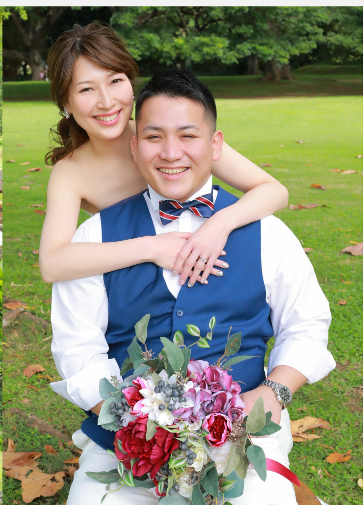
2020.01.01-01.07 We honeymooned in Hawaii