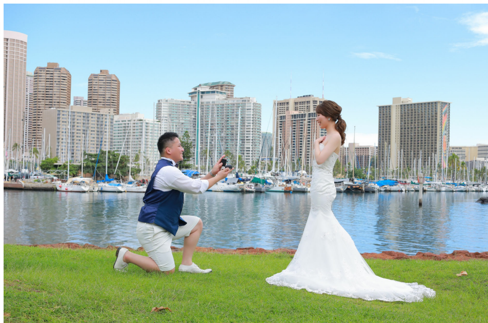
marriage registration 2019.5/1