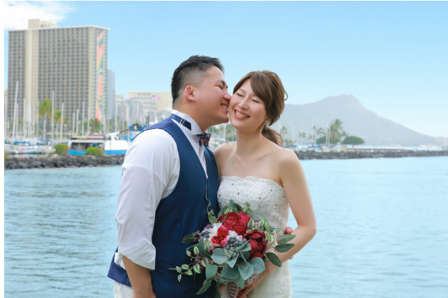
Will you marry me? 2018.10.17