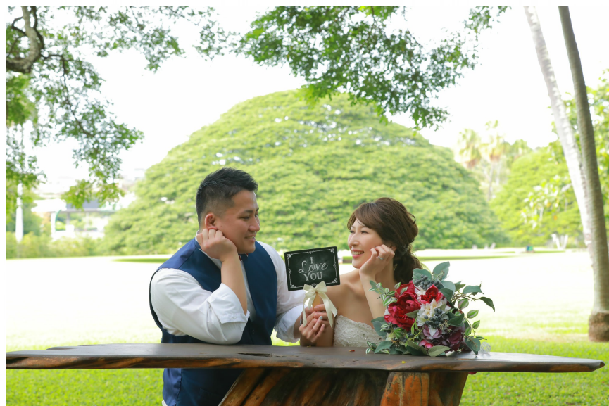
MoanaluaGardens monkey pod「日立の樹」